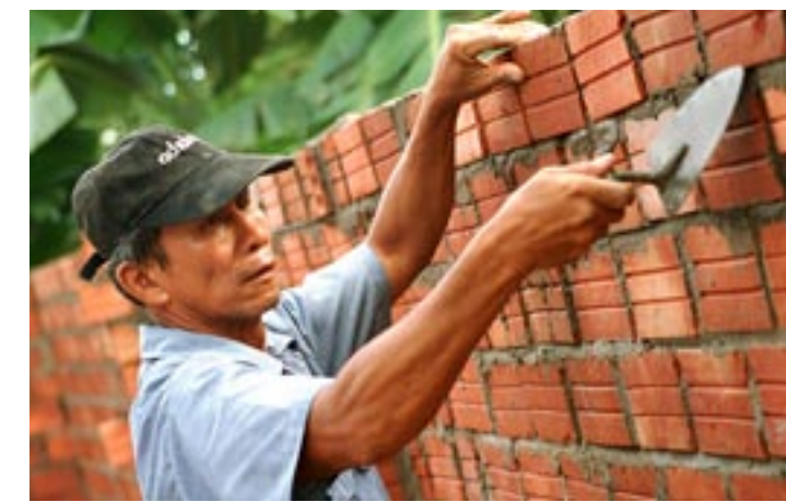
A man works on the wall of a house in Vietnam. Since 2002, Vietnam has been the site of a successful Save & Build program.

Today, Save & Build is expanding Habitat for Humanity’s worldwide impact to help many more families realize the advantages of homeownership. Through this innovative program, Habitat for Humanity is helping poor families work together to build their homes, repay their debts and become homeowners.